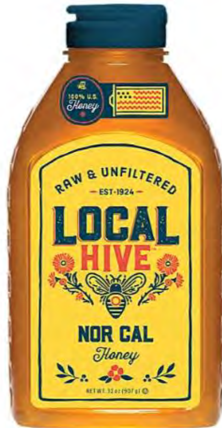
Organic Tart Cherry Juice.